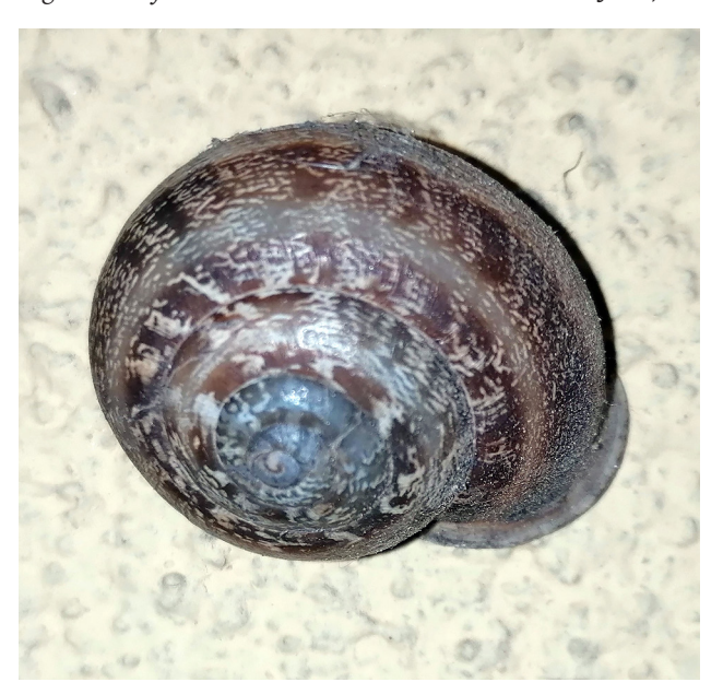
Fig. 3. Massylaea vermiculata found in Budapest in March, 2020 and uploaded to the www.fajbook.hu citizen science website. After a careful search, the specimen was re-found and captured two months later in May, 2020.