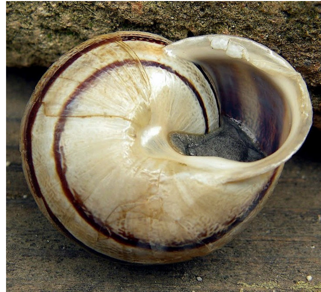
Fig. 2. Massylaea vermiculata found in Bratislava in June, 2019.